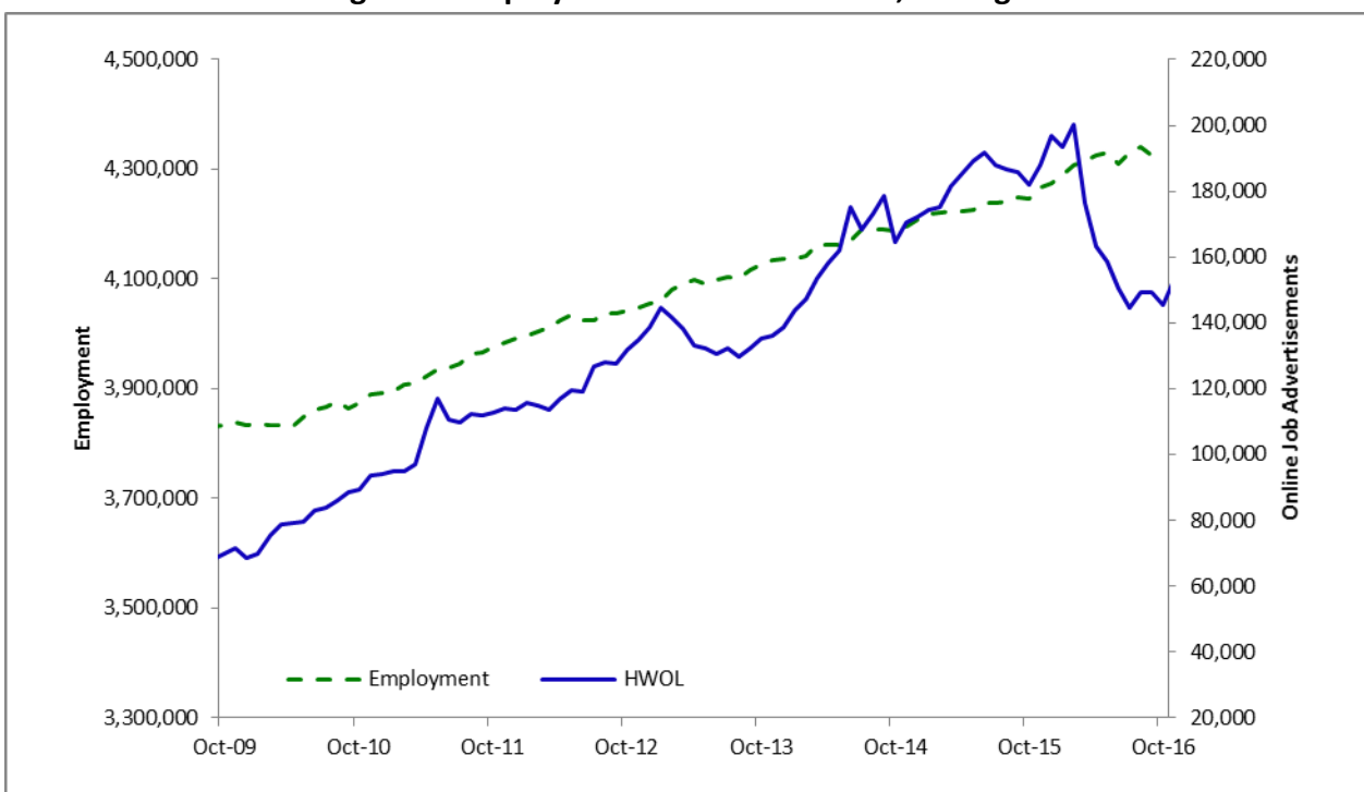
Figure 2: Employment v. Labor Demand, Michigan